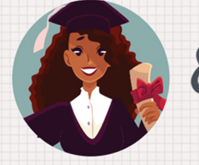
Have a high school diploma or equivalent