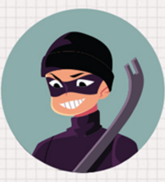
Be able to pass a criminal background check