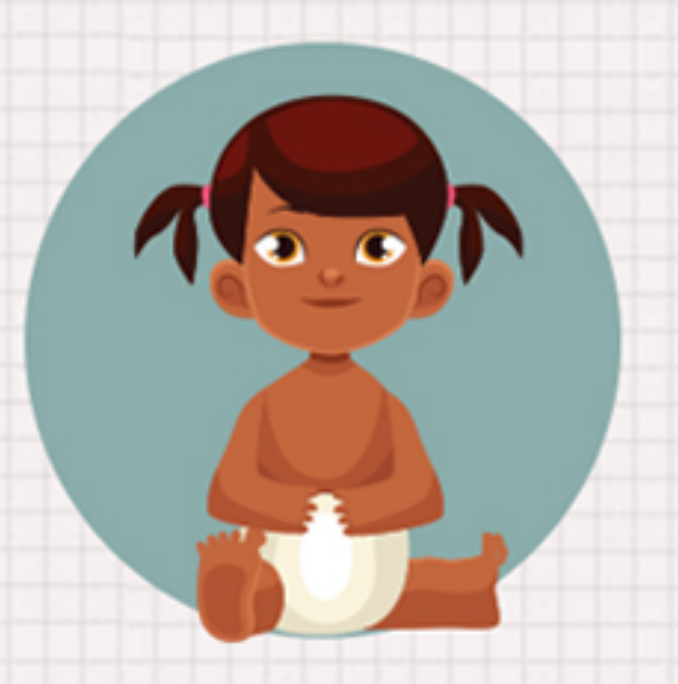
Be 18 years of age or older

In order to sit for the BACB<sup>®</sup>'s RBT exam, at the time of application you'll need to: